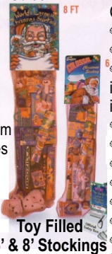
Toy Filled 6' & 8' Stockings

Lanyards and Eyewear Retainers Leis / Luau Supplies Letter Openers / Slitters Lobster Bibs / Crab Mallets Lucky Bamboo / Live Plants Luggage Tags Magnets Mardi Gras Supplies Matches / Lighters Menu and Restaurant Goods Mousepads and Desk Accessories Mugs / Steins / Drinkware Napkins / Paper Products Noisemakers: The Rapper / Clappers, Cow Bells, Egg Shakers, Harmonicas, Kazoos, Maracas, Whistles, Guitar Picks, Tambourines Novelties and Toys Ornaments Packaging Solutions Pads / Notebooks / Cubes Pens / Pencils / Erasers / Markers Plantable Stationery and Bookmarks Premiums Resort, Hotel and Casino Promos Safety Programs and Products for Children and the Workplace School and Cheering Products Scoops, Stoppers & Servers Snowglobes - make custom by inserting photos and large quantity import custom made globes Sports Items and Promotions Sportswear, Wearables and Hats Stadium Cushions Stress Relievers Stuffed Animals Sunglasses TakeOut Pails / Fortune Cookies / Chopsticks Temporary Tattoos Trade Show Giveaways Towels Umbrellas